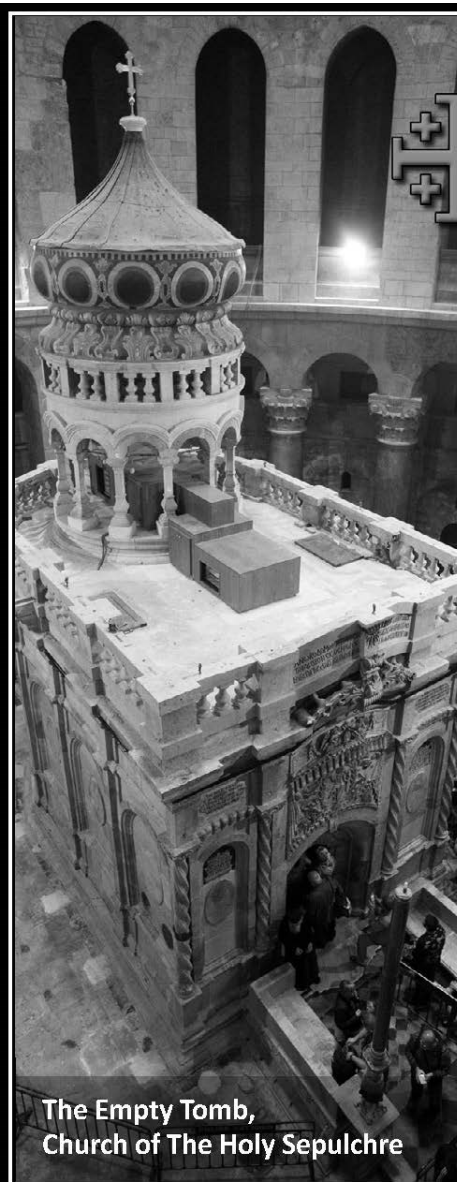
The Empty Tomb, Church of The Holy Sepulchre

Please pray for all of our men & women in the military.